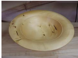
Bill Shean: Two square red