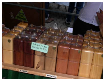
Unusual square pepper grinders

Now go south from Hobart on to Geeveston and to Island Inland Timbers which is a forestry mill.