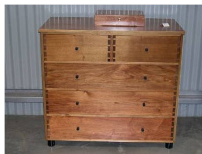
Handmade furniture at Launceston

Launceston has galleries and souvenir shops but we found the best places for timber products were the west and south coast areas.