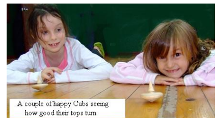
A couple of happy Cubs seeing how good their tops turn.