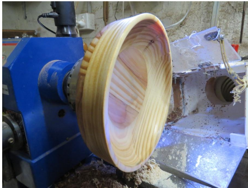
FINISHED BOWL ON LATHE

The product is made in Australia at Babinda, Queensland.