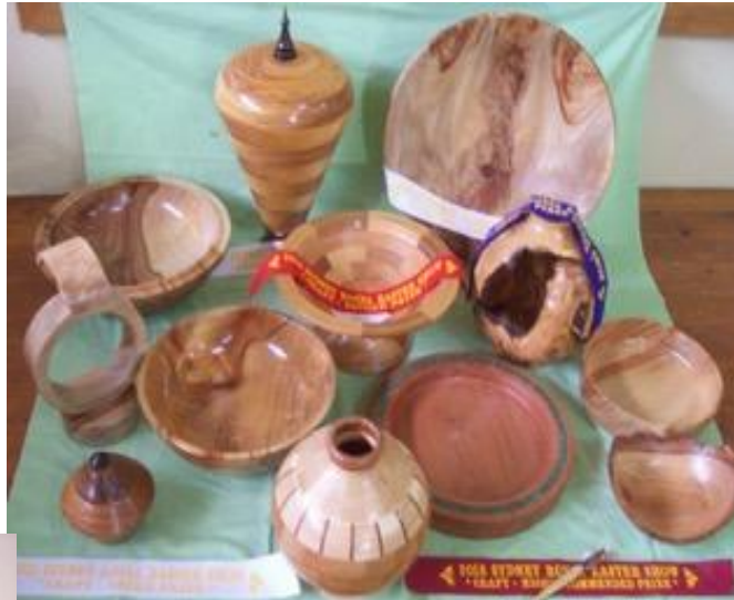
Bankstown Easter Show Pieces