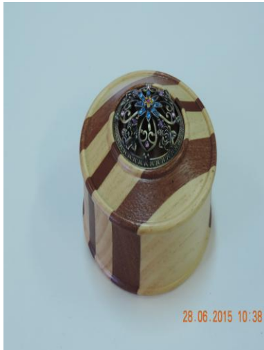
Pot Purri Pot Stan Buick