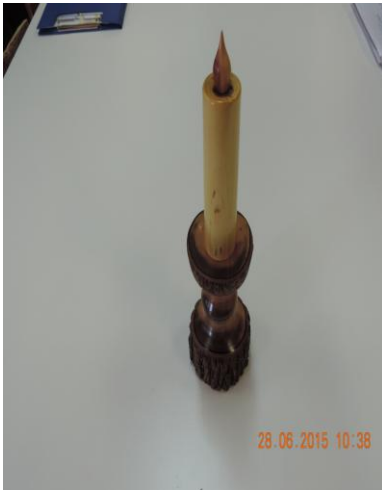
Candle Holder Stan Buick

The following photo's are from our Show and Tell: