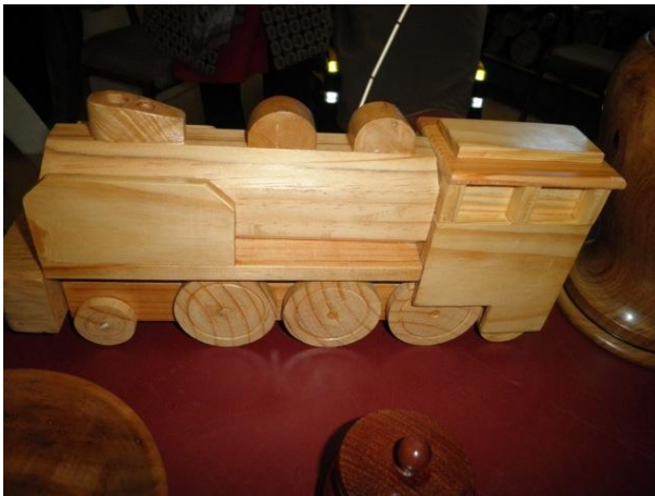
Gerry's train engine