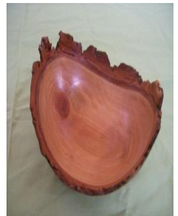
Natural Edged Bowl