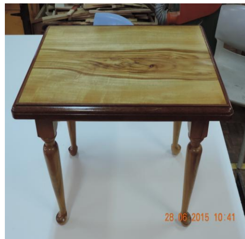
Small Table Keith Smith