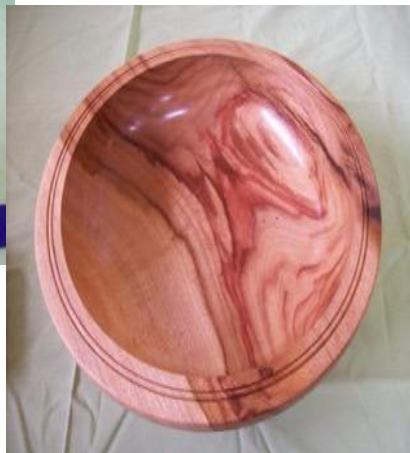
Camphor Laurel platter