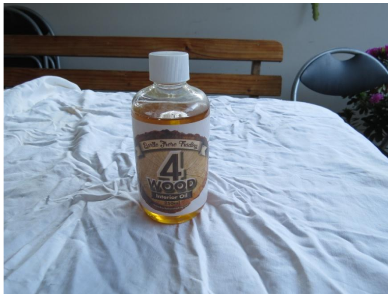
250ml 4 WOOD

“This is a clear wood finish formulated solely from refined natural plant oils that penetrate into your timber and self-dry / cure. Finishing options from matt sheen up to high patina given your choice and process advised.”