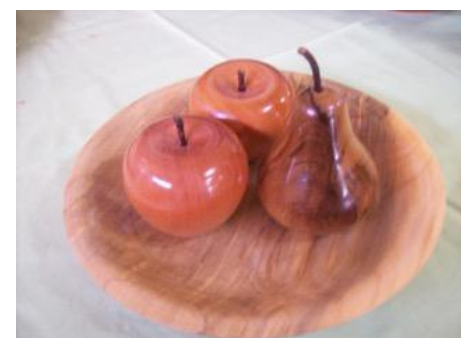
Bowl of Fruit