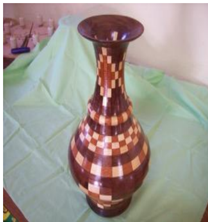
Segmented Vessel Fred Cassar