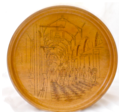
Ian Pye Pyro Platter, ??