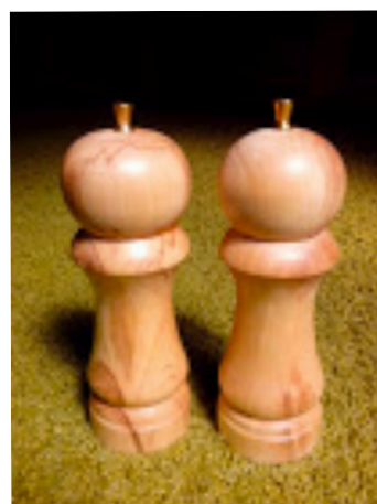
Rees Bunker Salt and Pepper grinders, Oak?