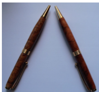
Roger Wilson Pens, Red Mallee, Brown Mallee