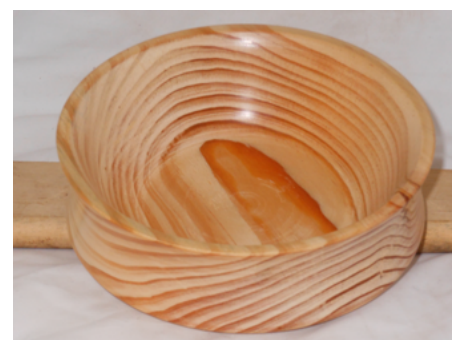
Finn Thorvaldson Bowl, Oregon