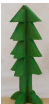
Bill Bailey Christmas Tree, Meranti