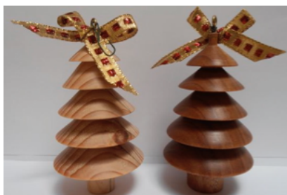
Roger Wilson Christmas Trees, Radiata & Qld Maple